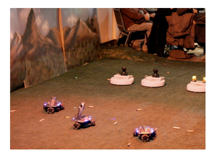
Figure 2: WoyUbu – Rovios battle iRobot Creates.

We have used PyRovio to implement simple Python-based actor-agents as part of WoyUbu, which is a collaborative intermedia performance presented in March 2009 by the University at Buffalo Intermedia Performance Studio and collaborators. WoyUbu is a "mashup" of Georg Buchner's 'Woyzeck' and Alfred Jarry's 'Ubu Roi'. The performance integrates live human actors, film, computer animation and video games, puppets, robots, and more. In one scene a group of Rovios battles an opposing group of iRobots. The battle consists primarily of a sequence of choreographed advances and retreats and other motions. For instance, when the Rovios are "attacking", they randomly move in small circles and raise and lower their webcams.