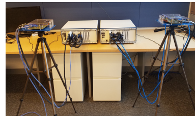
Figure 1: Two X60 nodes, each attached to a SiBeam phased array module.

This poster introduces X60 , the first highly configurable software defined radio (SDR) 60 GHz testbed, featuring fully programmable PHY, MAC, and Network layers, ultra-wide channels, and phased arrays. Based on the National Instrument's (NI) millimeter-wave (mmWave) Transceiver System [3] and equipped with user-configurable 12-element phased array antennas from SiBeam, X60 nodes (Figure 1) enable communication over 2 GHz wide channels using