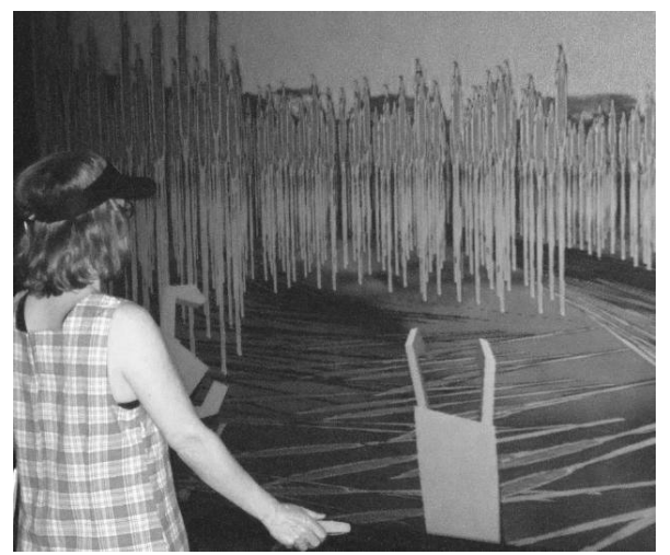
Figure 1: User in the reeds

In order to keep authorial control over pacing and the creation of surprise we base our VR dramas on a series of scenes with a distinct beginning, middle and end. The beginning introduces the environment and characters and an inciting incident reveals the protagonists' dilemmas or goals. In the middle the protagonists must overcome obstacles to their goals. The end contains the resolution. The narrative moves from scene to scene either as a result of the user's actions, or because a time limit has passed. At a finer granularity there are multiple ways in which the user can interact with agents or smart environments in each scene. These may have their own goals within the dramatic structure. They may act as guides to the user, or as opponents. The user has a certain amount of agency, but not absolute free will.