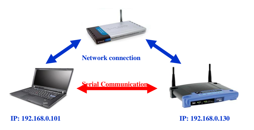
Figure 1 Basic NEXOS Network to Upload Embedded XINU to WRT54GL