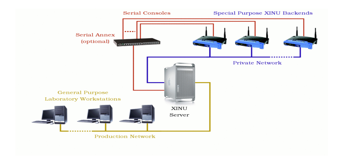
Figure 2 Expanded NEXOS environment with a central server

Figure 2 outlines the typical layout first used at Purdue and later nicknamed the warzone by the TinkerNet Project. A cadre of dedicated target machines resides on the private network (warzone) where students may load and run experimental kernels on demand. These dedicated, backend machines load a new O/S image from the central server across the network each time they reboot, allowing students to refresh the image frequently as they build their system.